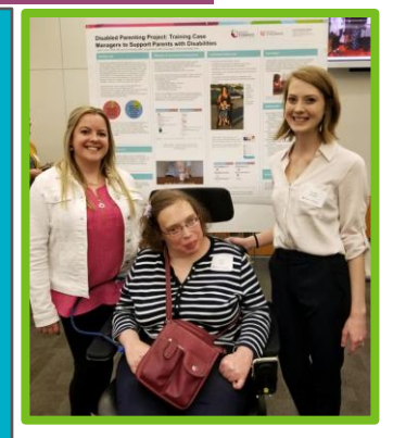
Winners of the UC/Nisonger LEND Poster Competition